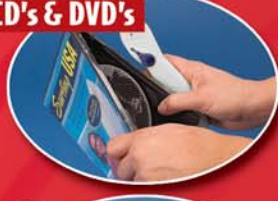
CD's & DVD's